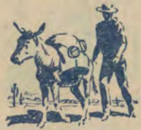
Table 50 Sacramento-Fair Oaks Stage Line

Lv Sacramento (via Sutter Creek) 8:00 AM, 2:15 and 5:45 PM; Ar Amador City 10:05 AM, 4:40 and 7:40 PM; Ar Jackson 10:25 AM, 4:20 and 8:00 PM.