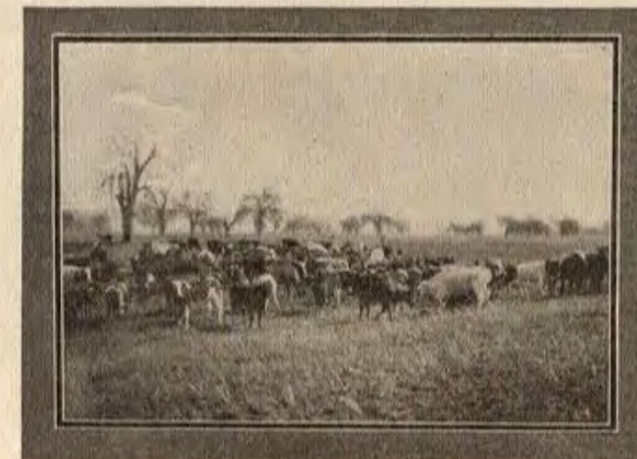
Ranch Scene in the Sacramento Valley

The trip over the Northern Electric offers a person an opportunity to view some of the largest Peach, Pear, Prune and Apricot orchards in California, passing directly in their midst.