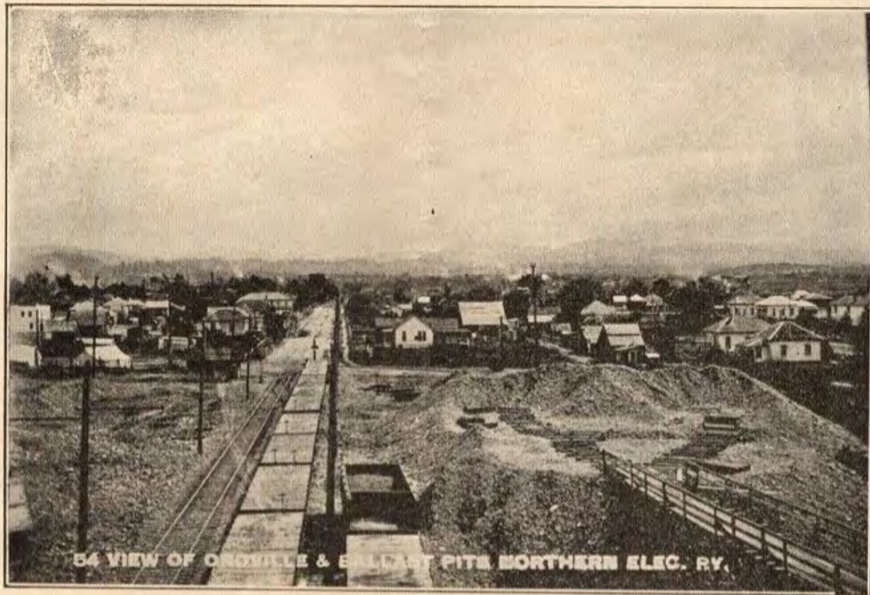
54 VIEW OF OROVILLE & EAST PITTS NORTHERN ELEC. RY.

OROVILLE. —The center of the greatest gold dredging operations in the world. A wondrous sight. This, aside from the busy city itself, which is exceptionally thriving. After leaving Oroville and going to the north, we pass through DURHAM. —A prosperous Northern California Town, with flouring mills and good surroundings, to CHICO. —The present terminal of the NORTHERN ELECTRIC RAILWAY, and when one considers its age on the one hand, and the immense match and sugar factories nearby, the city containing many beautiful homes, its hostleries not to be excelled by cities many times its population, and Chico Vecino (the famous Bidwell ranch), one would seem that they are in the East as well as the West. Beyond Chico, ten miles distant, with the best of stage facilities, are situated the well-known Richardson Health Springs, a visit to which will mean only health and pleasure. HAMILTON. —Trains leaving Chico at frequent intervals and passing to the west over the Sacramento River and through a section most beautiful and picturesque with the Coast Range as a background, the traveler arrives in the thriving city of Hamilton, at which place is located a $1,000,000.00 Beet Sugar Factory, which is one of the greatest industries in the Sacramento Valley.