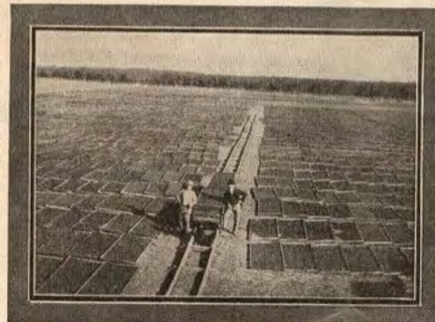
Drying Fruit Along the Line of the Northern Electric

pasture on the fields of alfalfa raised very extensively through the Valley.