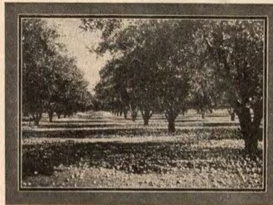
A Prune Orchard in the Sacramento Valley

The Orange in the Sacramento Valley is keeping pace with the other fruits, and the groves through which the Northern Electric trains pass, afford a most beautiful picture for the passenger.