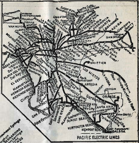
PACIFIC ELECTRIC LINES