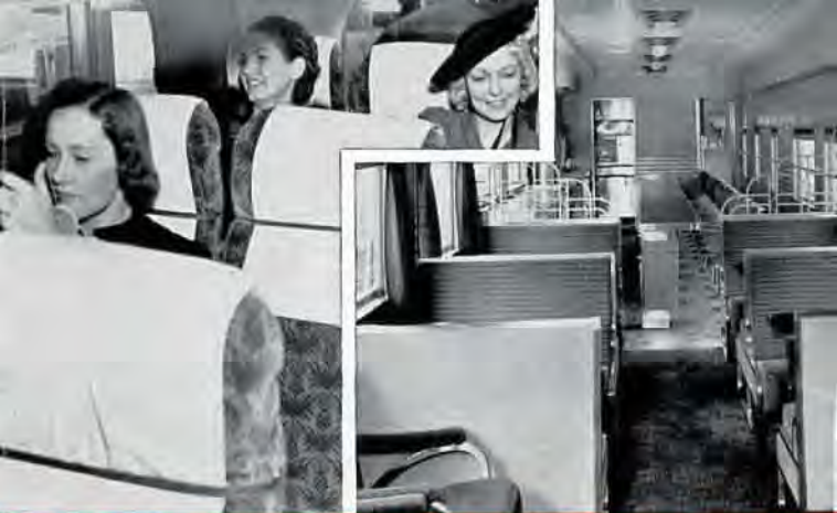
Left: Buses have sponge rubber seats adjustable to four positions. Right: Excellent meals available at low cost in the Tavern Diners on Santa Fe's new Streamlined Trains—"The Golden Gate" and "The San Diegan".