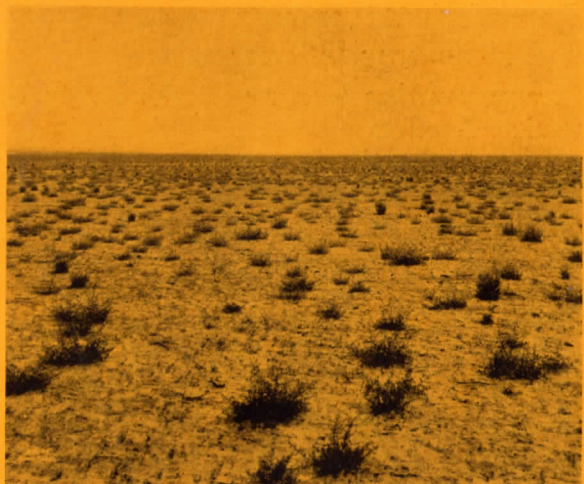
As We Find It Now