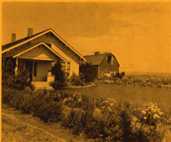
After Two Years of Irrigation