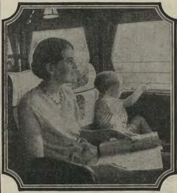
Luxurious comfort distinguishes every Greyhound Coach

Riding so many miles behind the nattily clad drivers, you could not have failed to note their superb skill, and the attentive consideration accorded every passenger. You probably noticed, too, how convenient the inside baggage racks were, how wide and clear the windows, and if the day chanced to be a little chilly, how delightfully welcome the warming currents of air from the dual Tropic-Aire heaters.