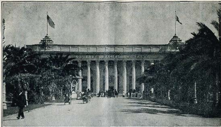
SOUTHERN PACIFIC BUILDING Panama-Pacific Exposition, San Francisco

You are cordially invited to make the SOUTHERN PACIFIC BUILDING your headquarters while visiting the Panama-Pacific Exposition—it is maintained for your comfort and accommodation. Rest rooms for men and women, ticket office and information bureau, and the Sunset Theatre, with comfortable seats, pipe organ and illustrated lectures—all absolutely free to you.