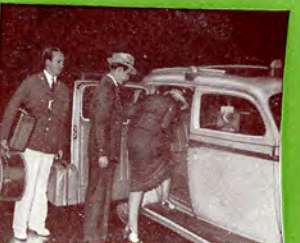
You are taken by taxi to your train.