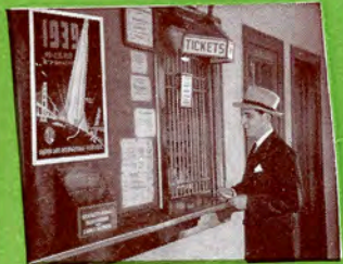
Advance arrangements made at home city.

In your possession are World's Fair admission tickets, as well as tickets entitling you to sight-seeing in San Francisco with a lecturer-guide to point out principal points of interest. Everything has been so perfectly arranged that during your stay in San Francisco you have little to do but enjoy yourself.