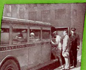
You see San Francisco comprehensively