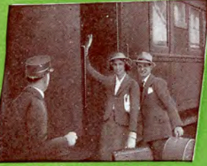
You start your World's Fair trip carefree.