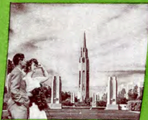
You have Admission Tickets for the Fair.