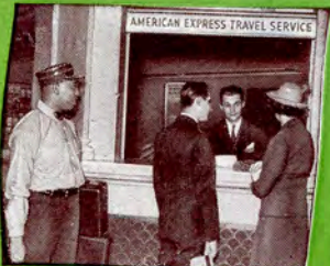
You are assisted at San Francisco terminal.