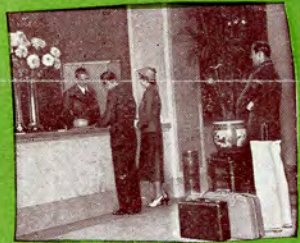
Your hotel room is assured.