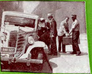
You are taken by taxi to your hotel.