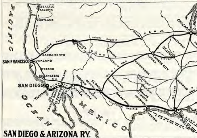
Table 22—SAN DIEGO & ARIZONA RY. SAN DIEGO, CARRISO GORGE, YUMA AND EAST