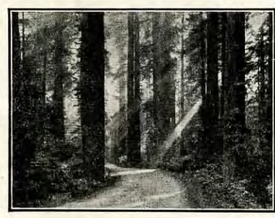
Tree-canopied roads like this are a part of the Redwood Empire Tour.

By Shasta Route to Grants Pass, by stage to Eureka and then by Northwestern Pacific to San Francisco, or reverse the routing—startling beauty all the way. It costs but $10.40 more. Ask your Southern Pacific agent for details.