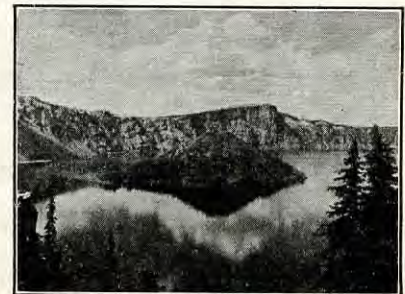
CRATER LAKE—Nature's Mystery.