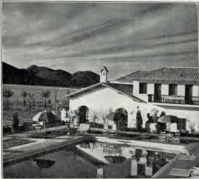
"Playa de Cortes," new Southern Pacific tourist hotel on the bay shore at Guaymas, has every modern convenience and luxury.