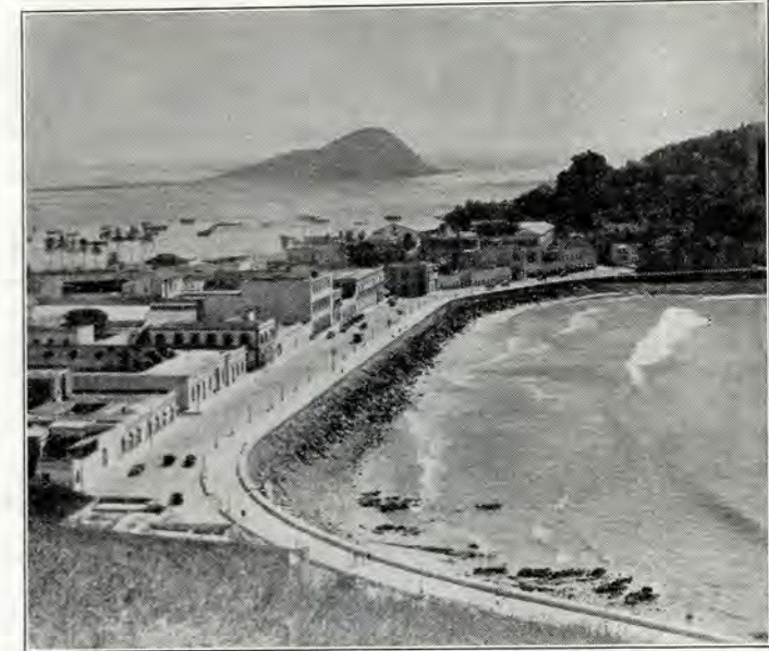
Mazatlan is a favorite stopover point on the West Coast Route. There is a very good hotel here, located on the boulevard facing the sea.

world, with its internationally famous glass curtain, represent attractions of immense interest to the most seasoned traveler. Truly Mexico City is intriguing! A great hand-carved door, a refreshing patio may hold you for an hour; her churches of great antiquity, brilliant public buildings, with their massive and artistic masonry, for an indefinite time.