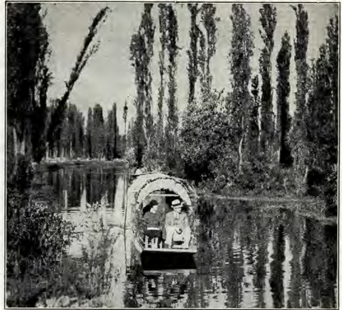
The floating gardens of Xochimilco, forty-five minutes from Mexico City. It is a beautiful experience to glide through these canals.

U. S. Custom regulations permit returning Americans to bring into this country, free of duty, 50 cigars or 300 cigarettes. Also, articles purchased in Mexico for personal use up to the value of $100 (U. S. money).