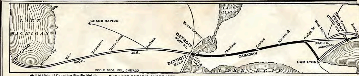
★ Location of Canadian Pacific Hotels THE LAKE ONTARIO SHORE LINE VIA BELLEVILLE MONTREAL, OTTAWA, TORONTO