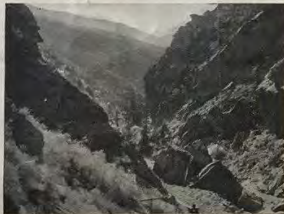
The Three Brothers

As the sturdy little engine pulls its load onward and upward, the ever-changing panorama presents innumerable scenes of interest and beauty. Here the steep cliffs are relieved by a magnificent, pine-clothed slope; there the canon widens to form a small, ver-