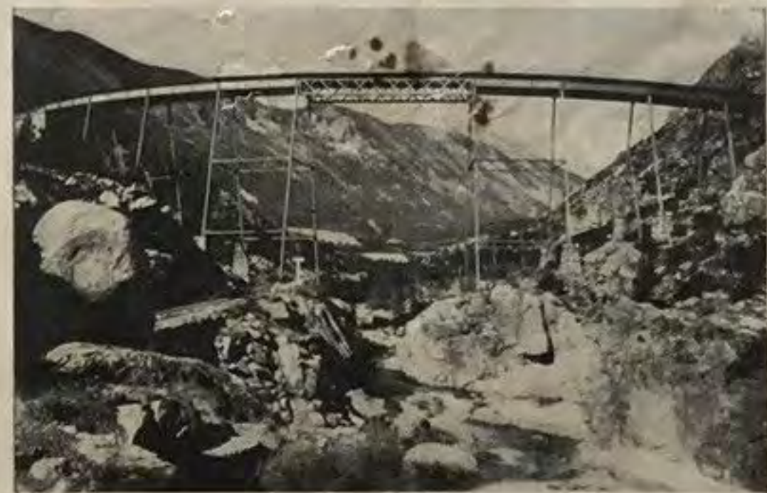
The High Bridge

The scenic grandeur increases constantly, every turn of the winding road disclosing some finer vista, until the station at Georgetown is reached. Here the passenger decides his trip is ended, for looking ahead he can see only a dark and forbidding rock wall, apparently barring further progress. However, the train backs away from the station to another track, and heading for a narrow opening