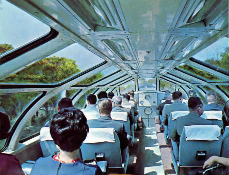
Discover America from Glass-Topped Stratadome Cars