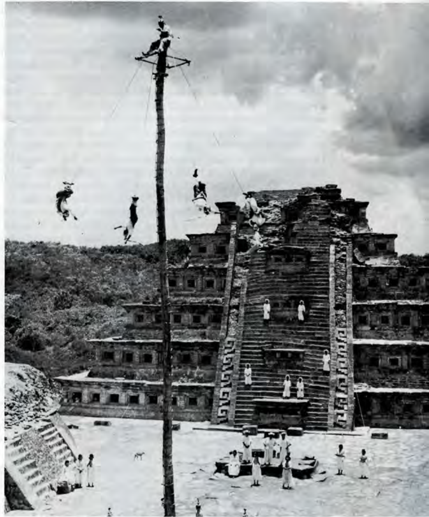
Flying pole dancers performing before the Pyramid of Tajin.— Archeological zone in the northern part of the State of Veracruz.

Assignment of Pullman space or reserved seats from stations other than those from which passengers board trains. When Pullman accommodations or reserved seats are requested from a station that has no regularly assigned space for sale, or that such space has been sold out, corresponding rail and sleeping car, or reserved seat fares will be assessed from point from which reservation is made.