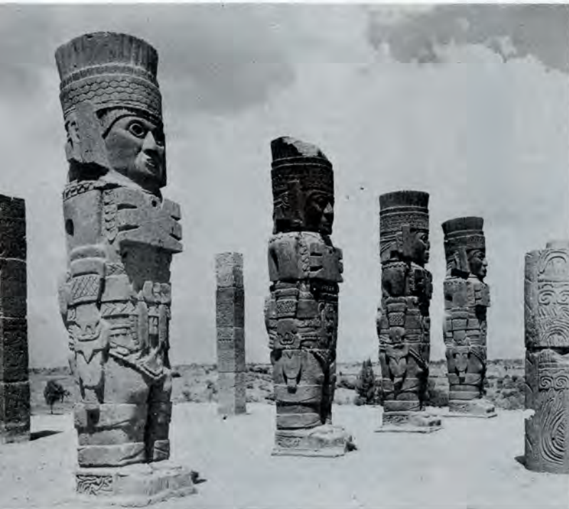
The "Atlantes."—Toltec civilization, archeological zone of Tula, State of Hidalgo.

The average visitor will wish to make Mexico City his base of operation for such side trips since it is one of the gayest metropolises of the continent. In the luxurious night clubs and country clubs, at the bull fights and horse races, you may rub shoulders with the great artists and writers, and industrialists, big and small from all over the world who are inclined like you to forget business to enjoy Mexico.