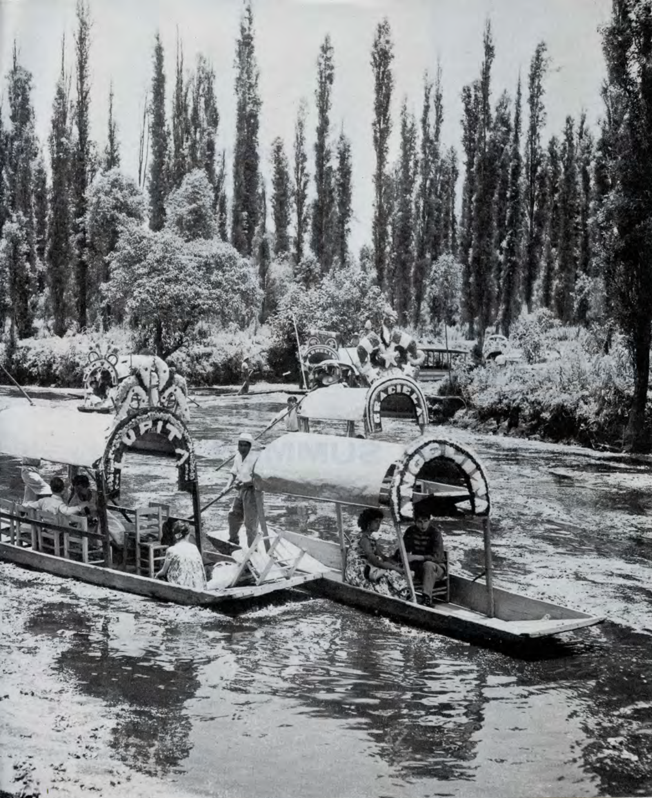
Floating Gardens in Xochimilco near Mexico City.