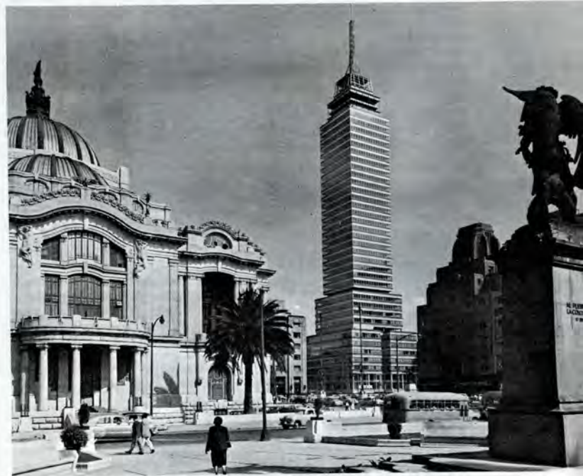
One of the new look constructions in Mexico City. The 44-story "Latino Tower" next to the Palace of Fine Arts.

In Mexico City the days are usually mild and the nights delightfully cool, with the temperature ranging from 35° F., with a mean temperature of 65° F.