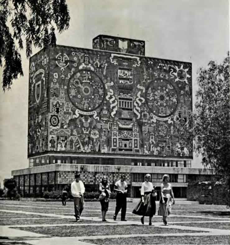
National University Campus, Mexico City