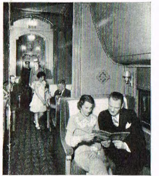
Pullman Standard Sleeping Cars