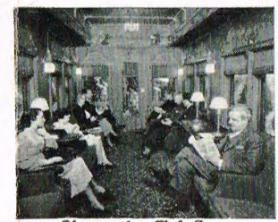
Observation Club Car

EQUIPMENT—No. 15 Every Car Air-conditioned Observation Club Car Chicago to Seattle-Tacoma Barber, bath, valet service; ladies' lounge; soda fountain; radio; daily market reports and news bulletins. Open Observation Car During Summer Months Harlowton to Avery Pullman Standard Sleeping Cars Chicago to Seattle-Tacoma 10 Sec.-Compt.-Drawing Room 8 Sec. 2 Compts.-Drawing Room "Off-the-Tray" Service in Coaches and Tourist Car Sandwiches 10c... Pie 10c... Milk 10c... Coffee 5c