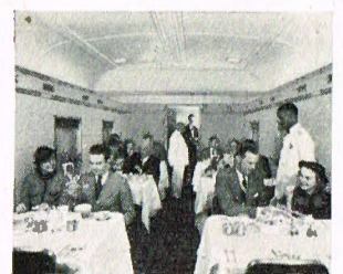
Meals as Low as 50c in the New 48 Seat Dining Car