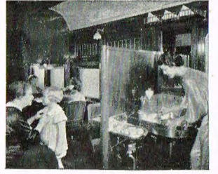
Women's Dressing Room, Tourist Sleeping Car