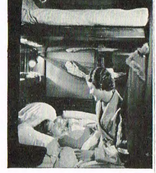
Comfort and Economy in Modern Tourist Sleeping Car