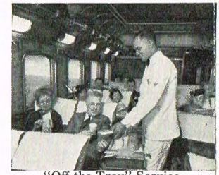
"Off-the-Tray" Service in Tourist Cars and Coaches