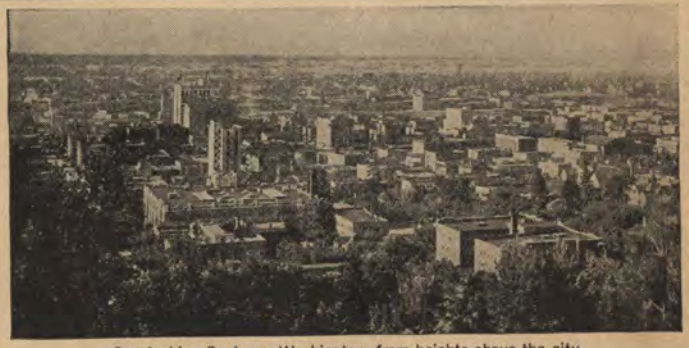
Overlooking Spokane, Washington, from heights above the city.

Time from 12:01 midnight to 12:00 noon shown in light-face type; time from 12:01 noon to 12:00 midnight shown in heavy face type. Figures opposite junction points refer to numbers of time tables showing diverging trains.