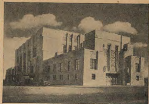
New Union Station, Omaha, Nebraska.