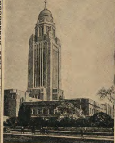
State Capitol Building, Lincoln, Nebraska

(Footnotes continued from page 28) ● For complete schedules of all connecting service between Cheyenne and points west, see following tables: Between Cheyenne and Ogden, see tables 15 and 16; between Ogden and Los Angeles, see table 17; between Ogden and San Francisco, see table 18; between Green River and Portland, see table 19.