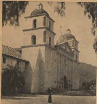
Summer spends the winter in romantic California Here is a view of one of her famous old Spanish Missions