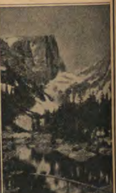
Dream Lake and Hallett Peak, Rocky Mountain National Park.

Save the Forests! The United States Timber Reserves are National Assets of Incalculable Value.