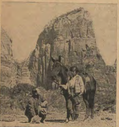
Zion National Park is reached via Union Pacific gateway to Southern Utah at Cedar City