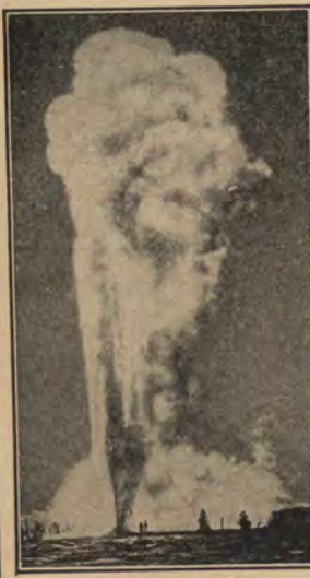
Old Faithful Geyser, Yellowstone National Park