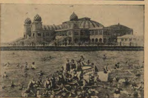
Saltair Pavilion and Bathers, Great Salt Lake, Utah