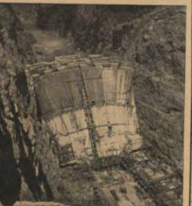
See Boulder Dam en route to California via Union Pacific. A short bus trip between trains at Las Vegas, Nev., takes you to the dam site and back for only $1.75.