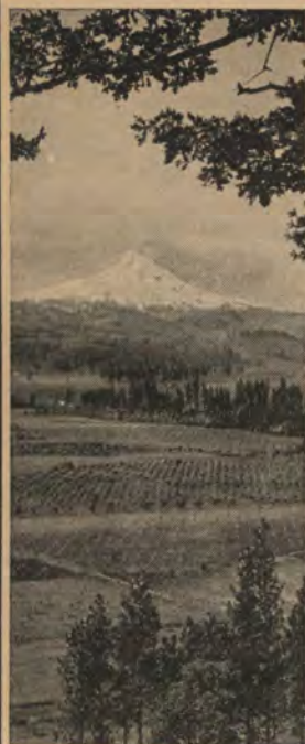
Mt. Hood, Oregon, is just one of the spectacular scenic features of a trip to Portland and the great Northwest via Union Pacific. For nearly 200 miles, Union Pacific follows the Columbia River through its great gorge, past the vast Bonneville Dam Site and past the foot of magnificent Multnomah Falls.