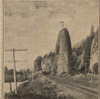
Pillars of Hercules, between Hood River and Portland

* Daily. † Meals. ‡ Daily, except Sunday. (S) Arrives U.P. Transfer depot, Council Bluffs. † First arrival June 19. * First departure June 19. * First departure June 20. (a) Passengers transfer from O.S.L. No. 6 to U.P. No. 6 at Green River. (b) Stops to let off passengers from Green River and east. (c) Stops to let off passengers from west and north of Pocatello and south of McCammon. (d) For complete time schedules to and from Spokane, via Umatilla, see Table No. 71; via Pendleton and Walla Walla, see Table No. 72. (e) Stops to let off paying passengers from east of Sherman. (f) Stops only on signal. (g) Stops on Saturdays and Sundays to let off paying passengers. (h) Stop to let off passengers from Cheyenne and east. (i) Stops to take on passengers for Shaniko and Bend Branches. (j) Flag stop on Sundays. (Footnotes continued on page 44.)