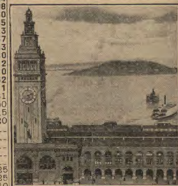
Ferry Building, San Francisco

▲ Train No. 27 will carry local passengers when provided with first-class railroad and Pullman tickets as follows: From Sidney, Neb., and points east (where scheduled to stop) only when ticketed to Cheyenne, Wyo., and points beyond where train stops. From Cheyenne (also points south) Laramie, Rawlins, Rock Springs, Green River, Granger and Evanston, Wyo., when ticketed to Ogden, Utah, and beyond where train stops.