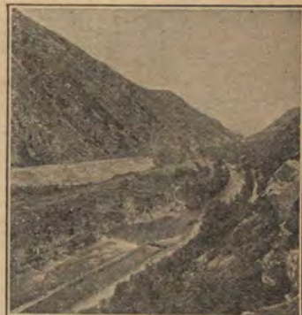
Weber Canyon, west of Echo, Utah

* Daily. † Daily, except Sunday. ‡ Daily, except Saturday. || Meals. (a) Stops to let off paying passengers from Laramie and east. (b) Will wait 30 minutes to make connection with No. 6 from Pocatello. (c) Stops to take on paying passengers for California and points south of Salt Lake. (d) Stops to let off paying passengers from Denver, Cheyenne, or east. (e) Stops only on signal. (x) Stops at Rock River, Medicine Bow, Hanna and Walcott to let off paying passengers from Colorado. (z) Leaves Denver 1.45 p.m., runs via Borie Cut-off, not via Cheyenne. ■ Extra fare train. Consult agent.