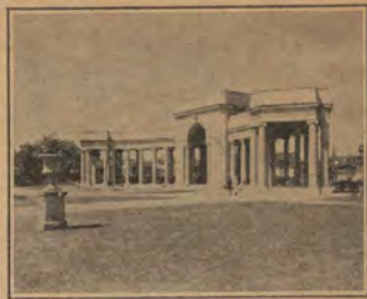
Voorhees Memorial, Civic Center, Denver, Colorado