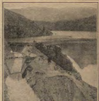
Arrowrock Dam, Boise, Idaho