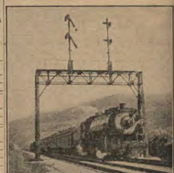
San Francisco Overland Limited