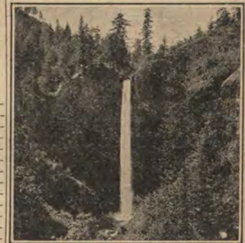
Latourell Falls, Columbia River Highway, Ore.