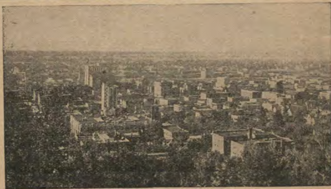
Overlooking Spokane, Washington, from heights above the city.