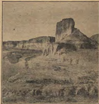
Castle Rock, Green River, Wyoming