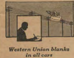
Western Union blanks in all cars

A Telegram will solve that problem —of guiding the office in that important matter; of reserving accommodations; of making appointments; of saying "hello!" to friends and family. Cost is low. The porter will see that your telegram goes from the next station. The Union Pacific System connects with Western Union—the one telegraph system that serves everyone everywhere.