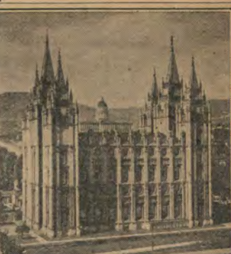
Mormon Temple and Utah State Capitol, Salt Lake City, Utah