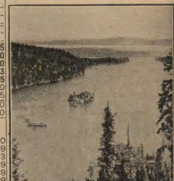
Emerald Bay, Lake Tahoe, California