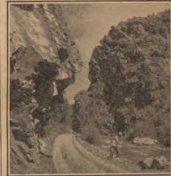
Bear Creek Canyon, Denver Mountain Parks