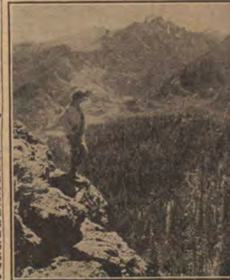
Longs Peak and Glacier Gorge, Rocky Mountain National Park

Save the Forests! The United States Timber Reserves are National Assets of Incalculable Value.