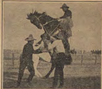
"Frontier Days", Cheyenne, Wyoming July 26-30, inclusive, 1927

See Table No. 19 for complete schedules to North Pacific Coast points.