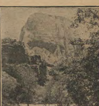
Great White Throne, Zion National Park; reached from Cedar City, Utah

▲ Train No. 27 will carry local passengers, when provided with first-class railroad and Pullman tickets, as follows: From Sidney, Neb., and points east (where scheduled to stop) only when ticketed to Cheyenne, Wyo., and points beyond where train stops. From Cheyenne (also points south), Laramie, Rawlins, Rock Springs, Green River, Granger and Evanston, Wyo., when ticketed to Ogden or Salt Lake City and beyond, where train stops.