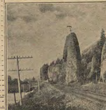
Pillars of Hercules, between Hood River and Portland