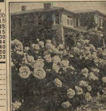
"For You a Rose in Portland Grows"

*Last train in time for complete Park tour arrives West Yellowstone, Sept. 15th. *Last train of season leaves West Yellowstone, Sept. 19th.