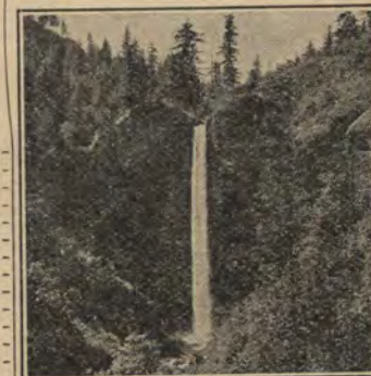
Latourelle Falls, Columbia River Highway, Ore.