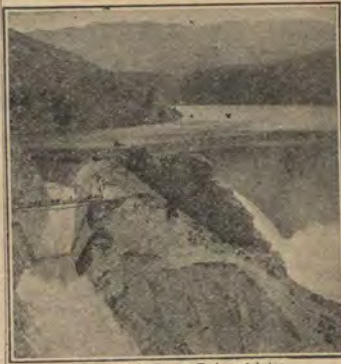
Arrowrock Dam, Boise, Idaho