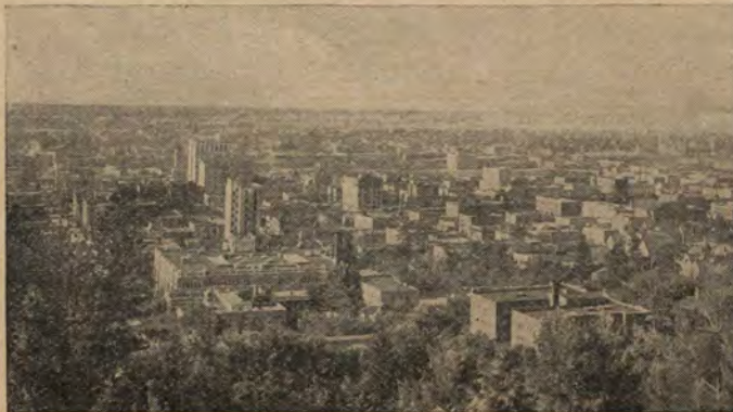
Overlooking Spokane, Washington, from heights above the city.

Figures opposite junction points refer to numbers of time tables showing diverging trains.