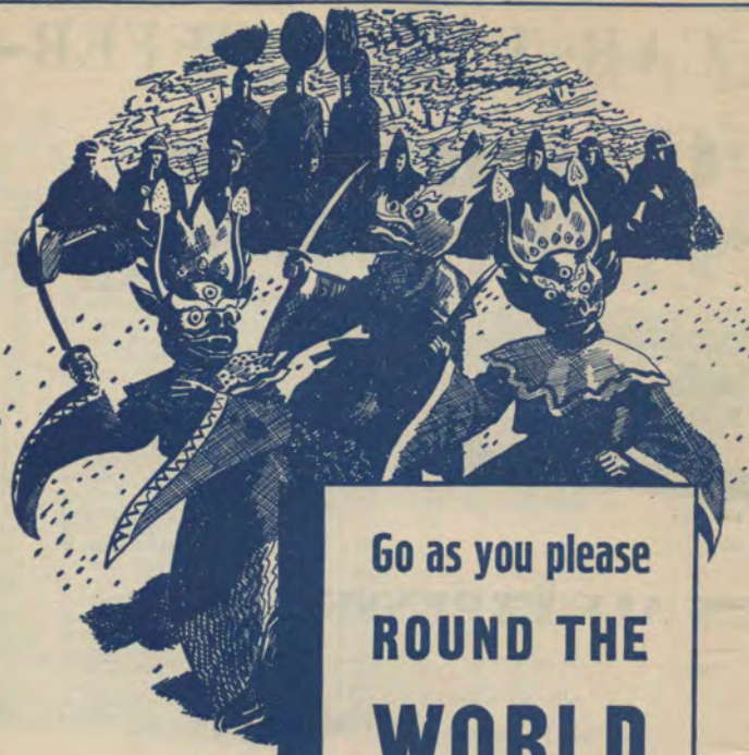
Thrill to the rhythm of Oriental Devil Dancers