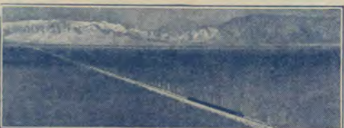
"Going to Sea by Rail" Across Great Salt Lake