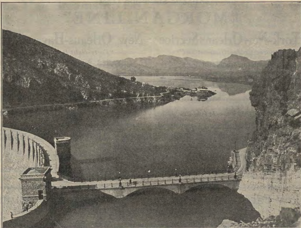
Roosevelt Dam and Lake—Apache Lodge on Promontory

A One-Day Rail and Auto "Detour"—Maricopa via Phoenix, Roosevelt Dam and Globe to Bowie, or "Side-Trip" Bowie via Globe to Roosevelt Dam and Return, over the Apache Trail Highway