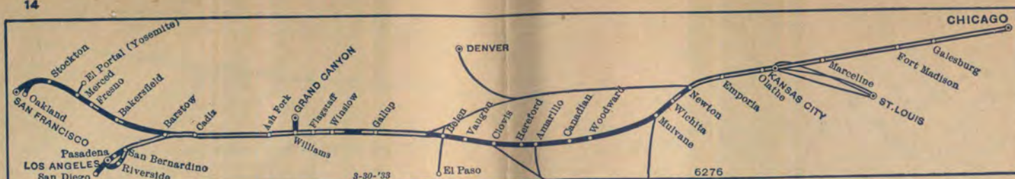
Chicago, Kansas City and California