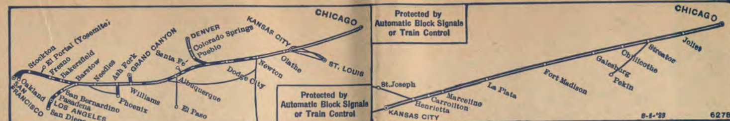
(D) California and Kansas City, Chicago