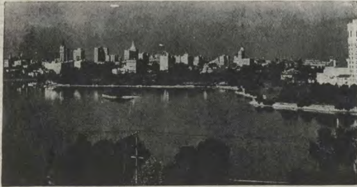
OAKLAND'S SKYLINE ACROSS LAKE MERRITT

A LL street railway and motor coach lines, with the exception of "KEY SYSTEM" trains, are distinguished by route numbers, as designated in the map on the inner page. The numbers given after each point of interest indicate the lines by which it may be reached; in a few instances a short walk may be necessary. Free transfers are interchanged between street railway and motor coach lines and those portions of the urban lines of the "KEY SYSTEM" which are devoted to local service. If you are not near the line which operates to the point to which you wish to go, you may transfer to it from any connecting line. The exact course of each line is shown in the map.