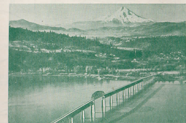
Columbia River and Mount Hood, 11,225 feet, from Bingen-White Salmon S. P. & S. Ry.