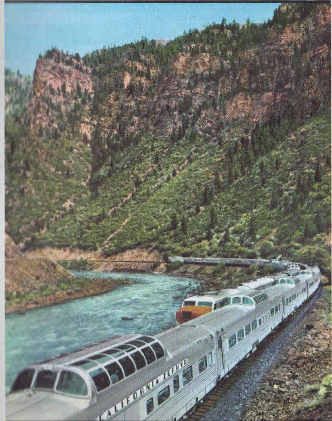
California Zephyr—Glenwood Canyon, Colorado River