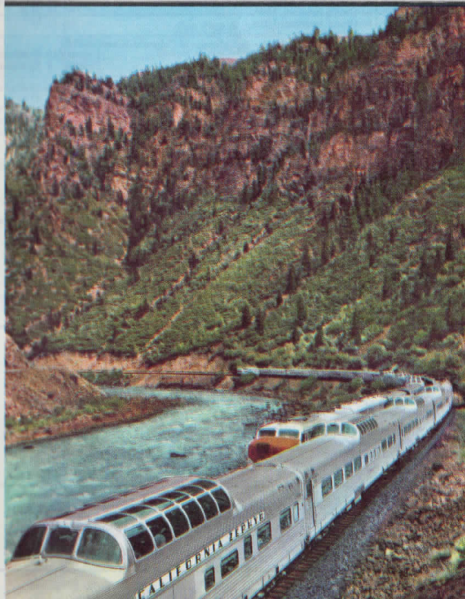
California Zephyr—Glenwood Canyon, Colorado River