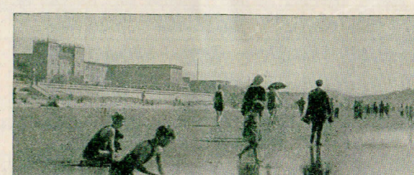
Hotel Seaside, Promenade and Bathing Beach, Seaside

Opportunities are many for short week-end hikes into the mountains along the Columbia River, such as historic Beacon Rock, or the site of the frontier blockhouses near Cascades, Wash.; the Crooked, Deschutes and Wind River Canyons.