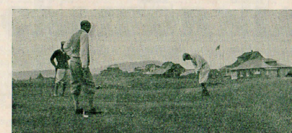
All Year Golf is Played at Gearhart and Seaside on the Pacific Ocean

the Columbia; and Bend, elevation 3,600 feet, on the great plateau of Central Oregon east of the Cascade Mountains, reached by a night ride from Portland.