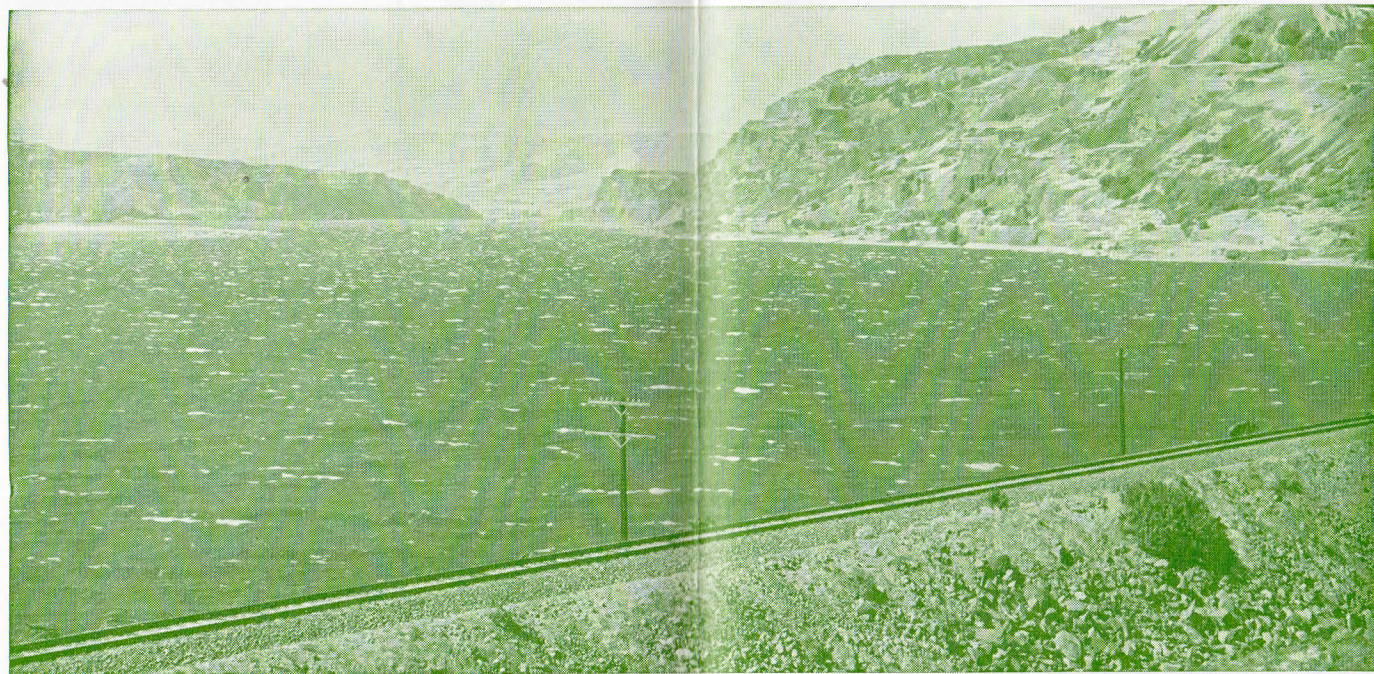
S. P. & S. Ry. Along The Columbia River Near Lyle, Washington