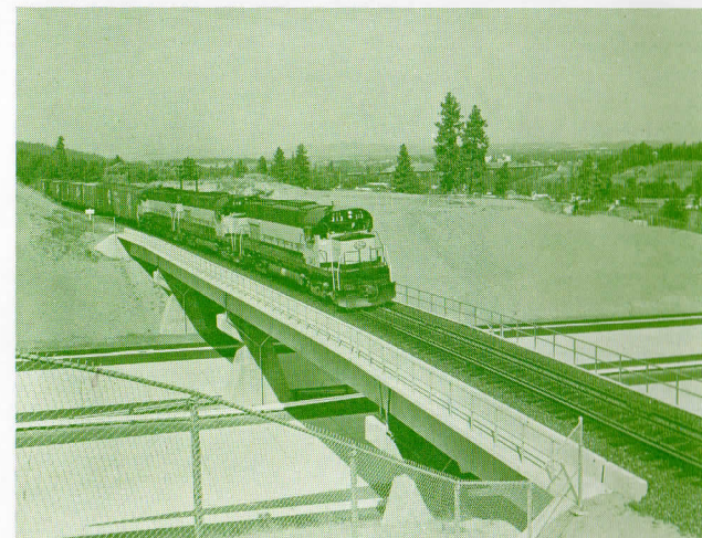
Spokane, Portland and Seattle Railway with Spokane, Washington in the background