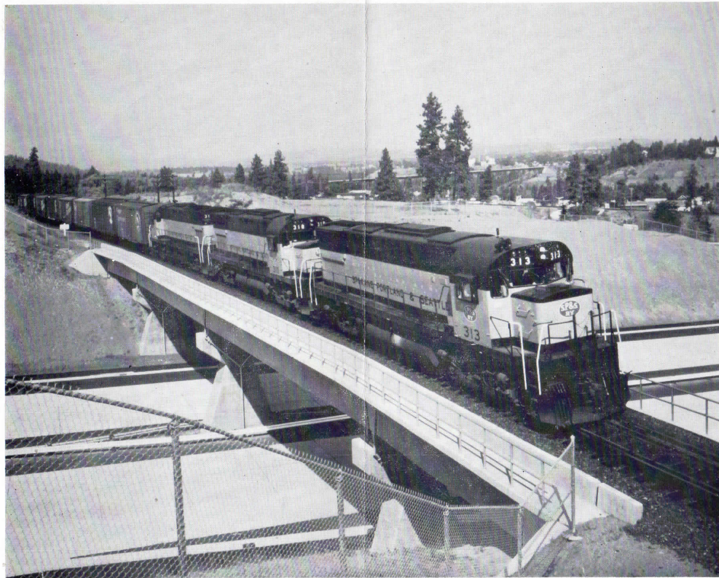
Spokane, Portland & Seattle Railway with Spokane, Washington in the background.