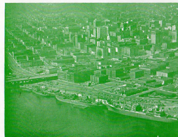
Portland - the Rose City

Your Choice of... Two Daily Trains Between PORTLAND and SPOKANE