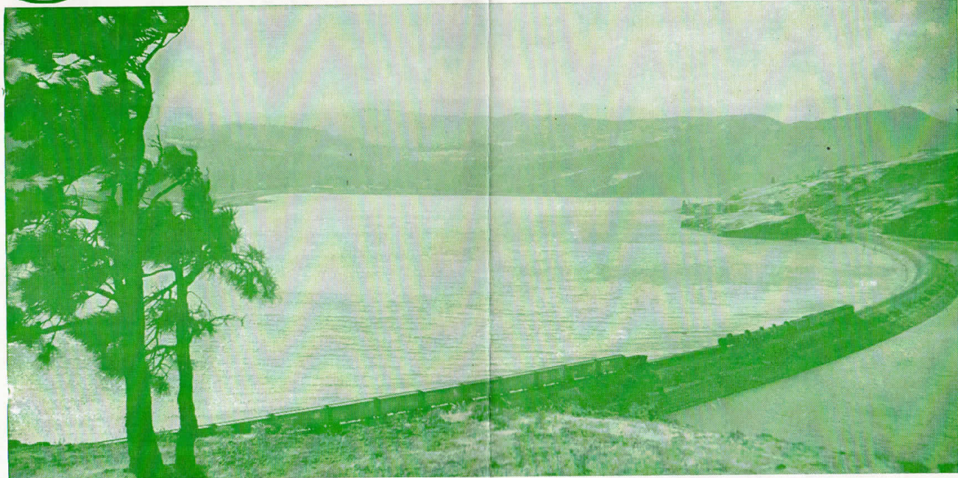
S. P. & S. Ry. Near Bingen-White Salmon, Washington

S. P. & S. RY. - OREGON TRUNK RY. - OREGON ELECTRIC RY. - (Subsidiaries of Northern Pacific and Great Northern Railways)