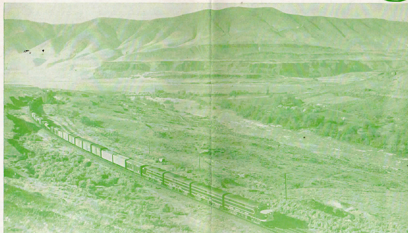
Oregon Trunk Ry. Near Moody, Oregon