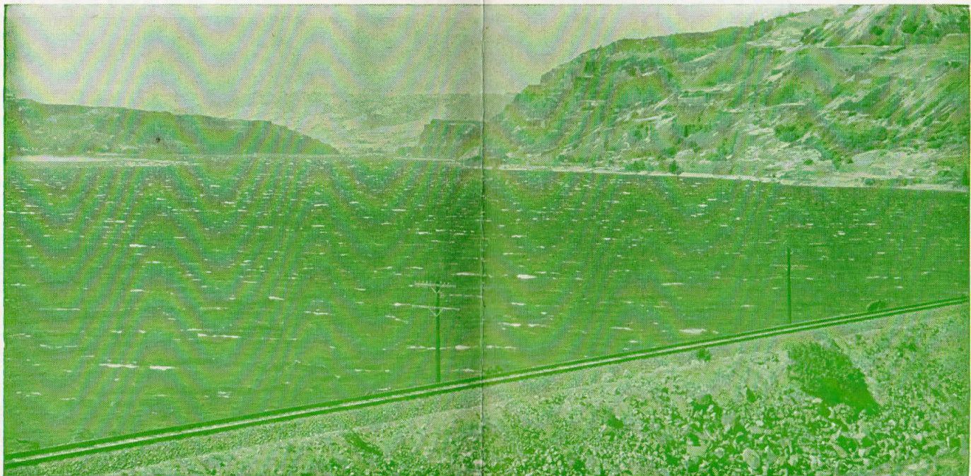
S. P. & S. Ry. Along The Columbia River Near Lyle, Washington