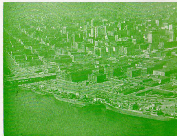
Portland - the Rose City

Your Choice of... Two Daily Trains Between PORTLAND and SPOKANE