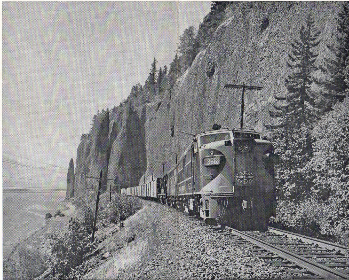
Cape Horn on the Columbia River