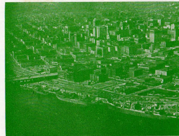
Portland - the Rose City

Your Choice of ... Two Daily Trains Between PORTLAND and SPOKANE