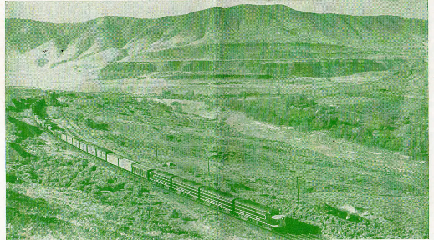
Oregon Trunk Ry. Near Moody, Oregon

S. P. & S. Ry. - OREGON TRUNK Ry. - OREGON ELECTRIC Ry. - (Subsidiaries of Northern Pacific and Great Northern Railways)