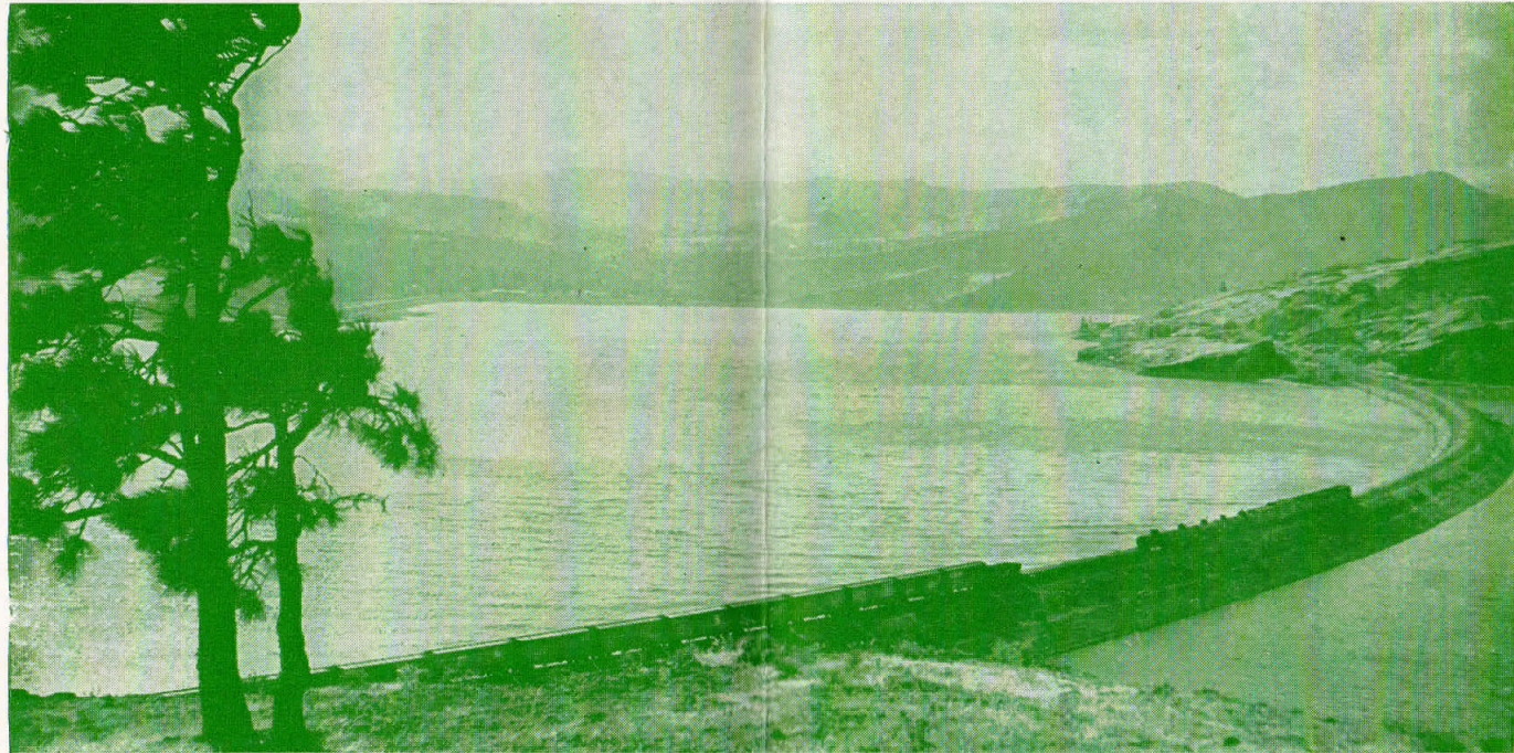
S. P. & S. Ry. Near Bingen-White Salmon, Washington

S. P. & S. Ry. - OREGON TRUNK Ry. - OREGON ELECTRIC Ry. - (Subsidiaries of Northern Pacific and Great Northern Railways)