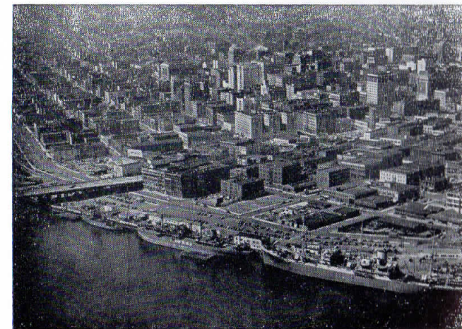
Portland - the Rose City

Your Choice of... Two Daily Trains Between PORTLAND and SPOKANE