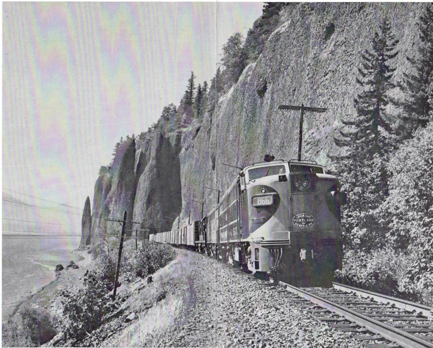
Cape Horn on the Columbia River