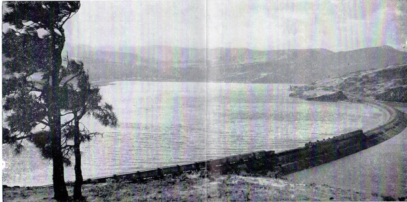
S. P. & S. Ry. Near Bingen-White Salmon, Washington

S. P. & S. RY. - OREGON TRUNK RY. - OREGON ELECTRIC RY. - (Subsidiaries of Northern Pacific and Great Northern Railways)