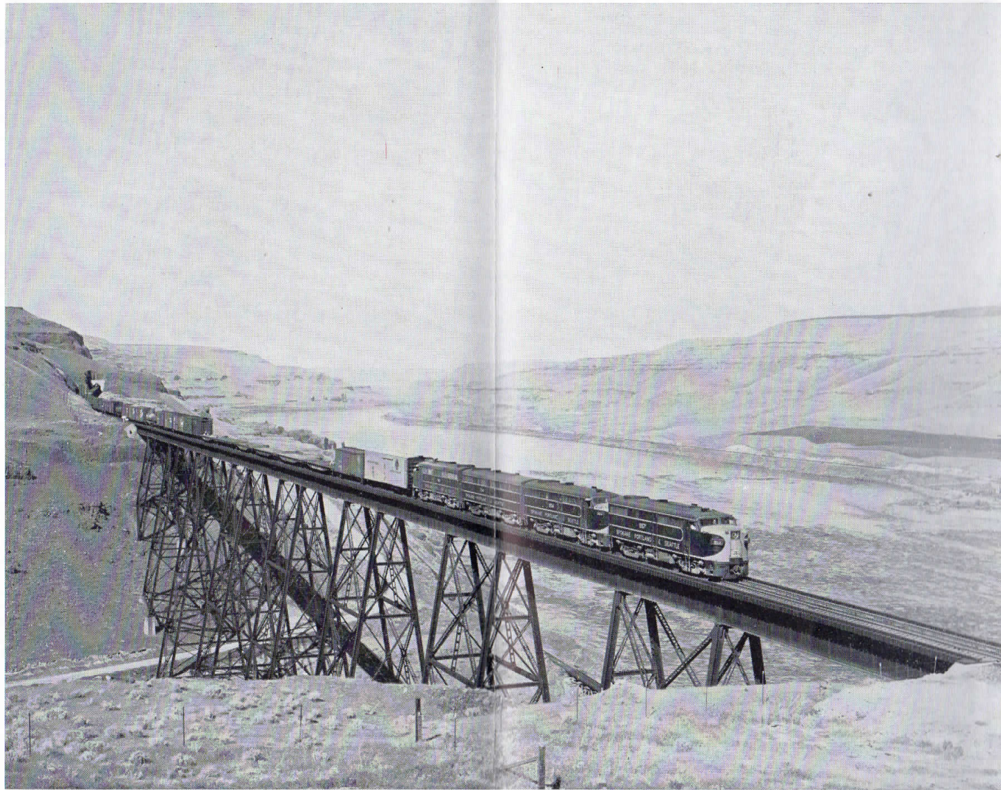
S. P. & S. Freight Train Crossing Burr Canyon Bridge Along the Snake River