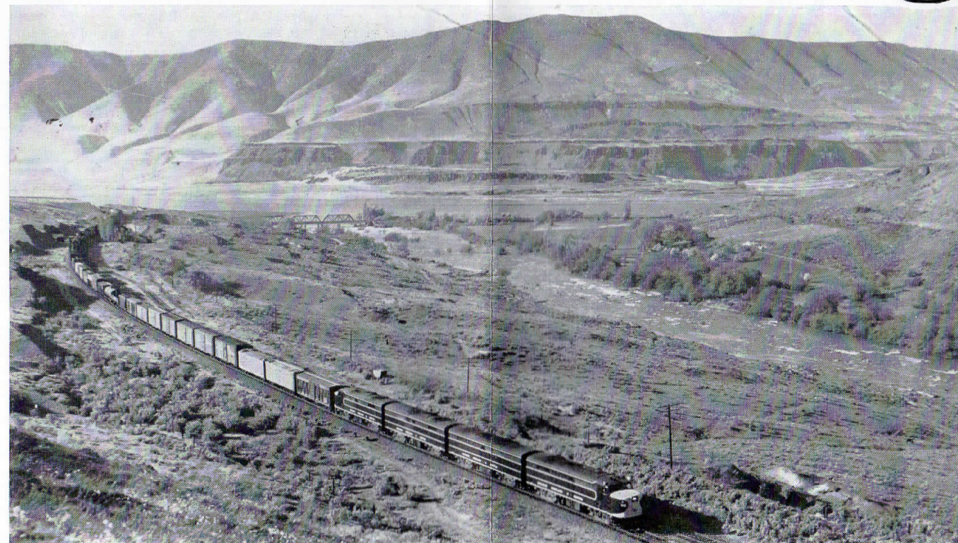
Oregon Trunk Ry. Near Moody, Oregon

S. P. & S. RY. - OREGON TRUNK RY. - OREGON ELECTRIC RY. - (Subsidiaries of Northern Pacific and Great Northern Railways)