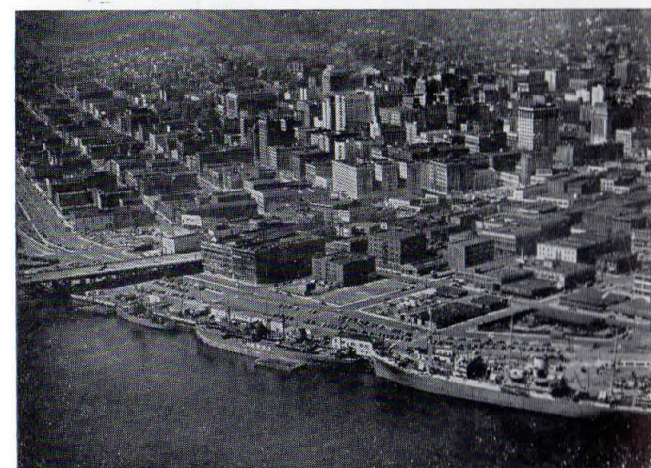
Portland - the Rose City

Just phone Railway Express. Prompt pick-up and fast delivery within established vehicle limits.