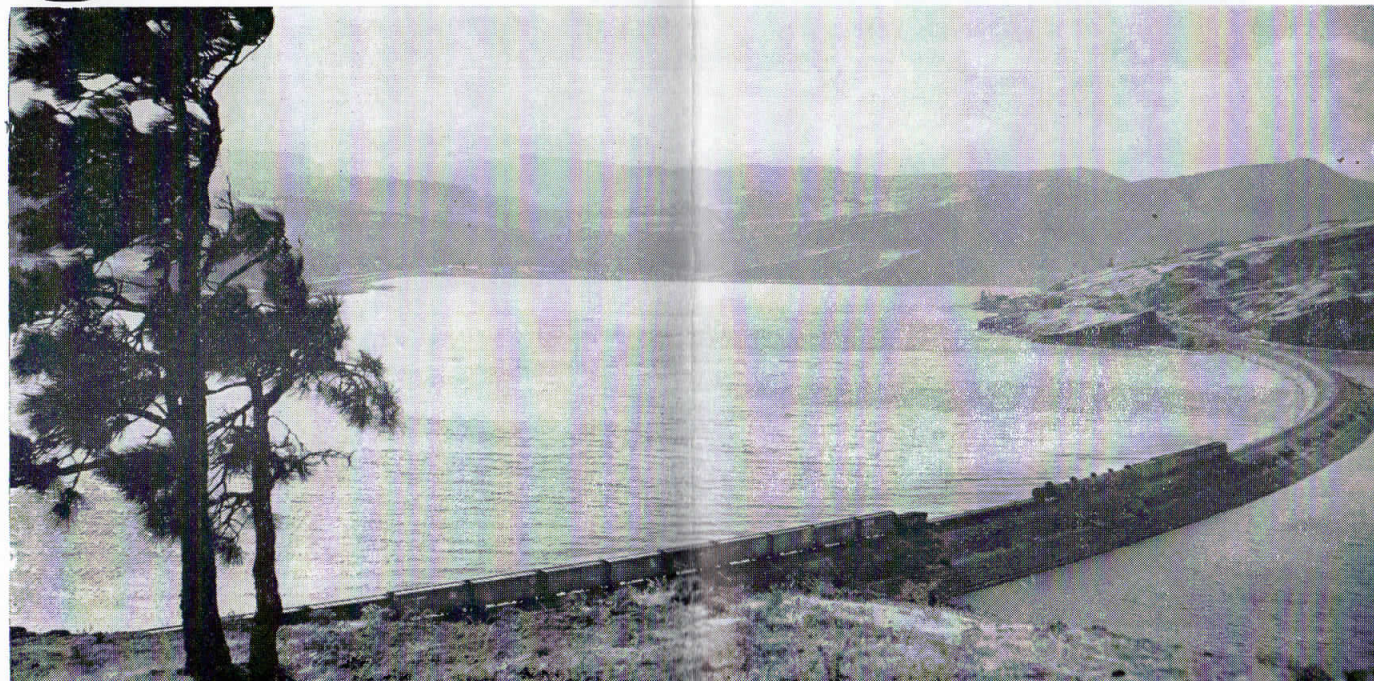
S. P. & S. Ry. Near Bingen-White Salmon, Washington

S. P. & S. RY. - OREGON TRUNK RY. - OREGON ELECTRIC RY. - (Subsidiaries of Northern Pacific and Great Northern Railways)