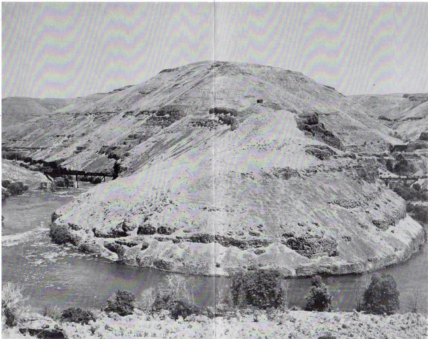
Double Crossing of The Deschutes River by The Oregon Trunk Railway near Sherar, Oregon