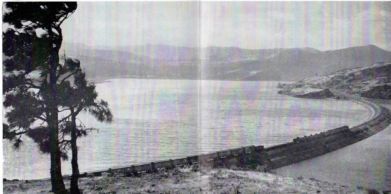
S. P. & S. Ry. Near Bingen-White Salmon, Washington

S. P. & S. RY. — OREGON TRUNK RY. — OREGON ELECTRIC RY. — (Subsidiaries of Northern Pacific and Great Northern Railways)