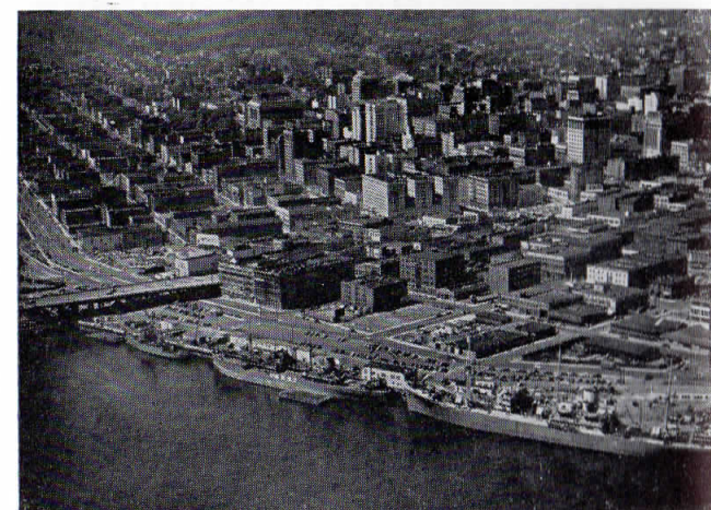
Portland — the Rose City

Your Choice of... Two Daily Trains Between PORTLAND and SPOKANE