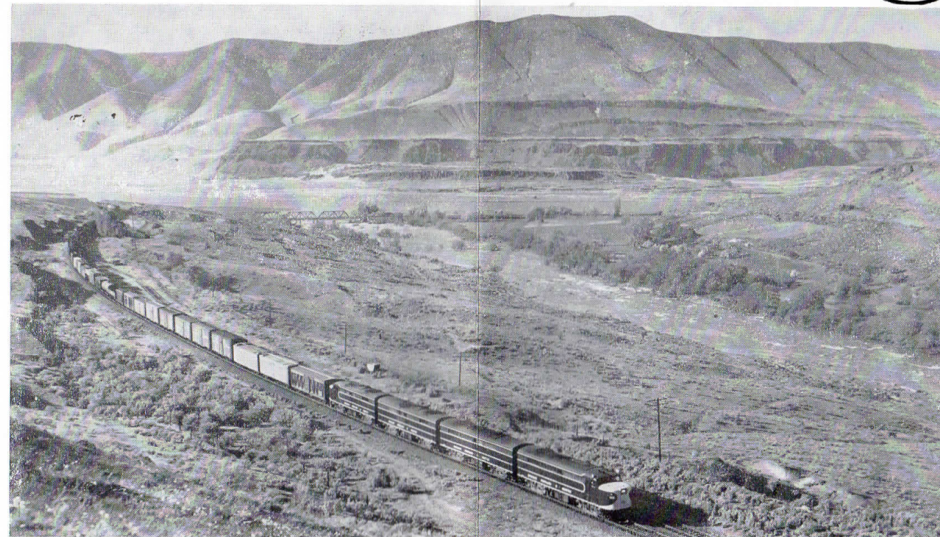
Oregon Trunk Ry. Near Moody, Oregon

S. P. & S. RY. — OREGON TRUNK RY. — OREGON ELECTRIC RY. — (Subsidiaries of Northern Pacific and Great Northern Railways)