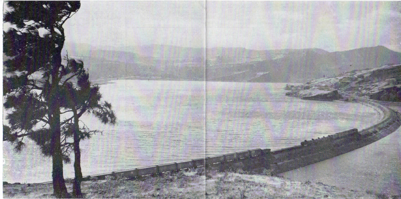
S. P. & S. Ry. Near Bingen-White Salmon, Washington

S. P. & S. RY. - OREGON TRUNK RY. - OREGON ELECTRIC RY. - (Subsidiaries of Northern Pacific and Great Northern Railways)