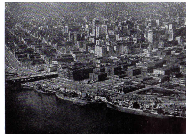
Portland - the Rose City

Your Choice of . . . Two Daily Trains Between PORTLAND and SPOKANE