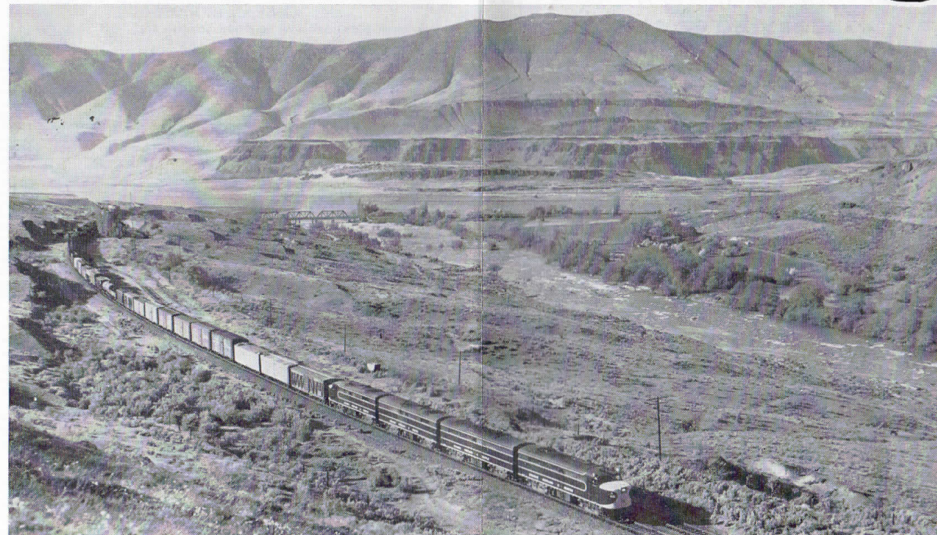
Oregon Trunk Ry. Near Moody, Oregon

S. P. & S. RY. - OREGON TRUNK RY. - OREGON ELECTRIC RY. - (Subsidiaries of Northern Pacific and Great Northern Railways)