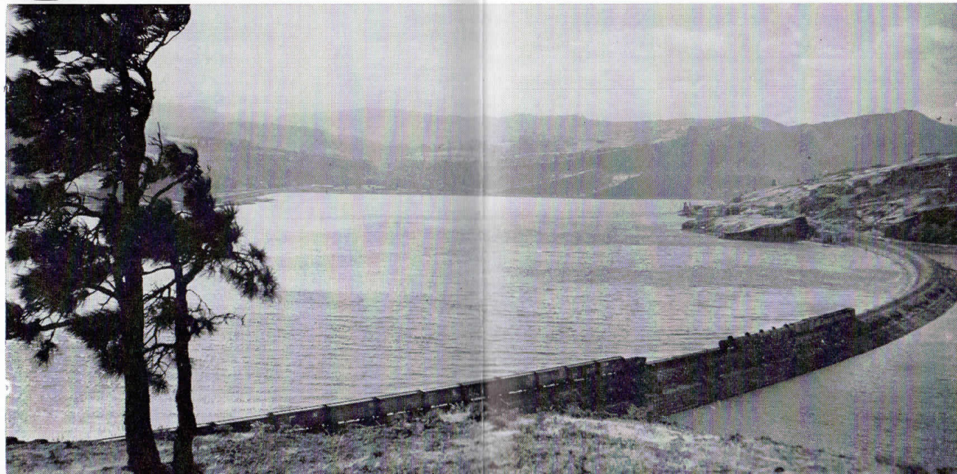
S. P. & S. Ry. Near Bingen-White Salmon, Washington

S. P. & S. RY. - OREGON TRUNK RY. - OREGON ELECTRIC RY. - (Subsidiaries of Northern Pacific and Great Northern Railways)