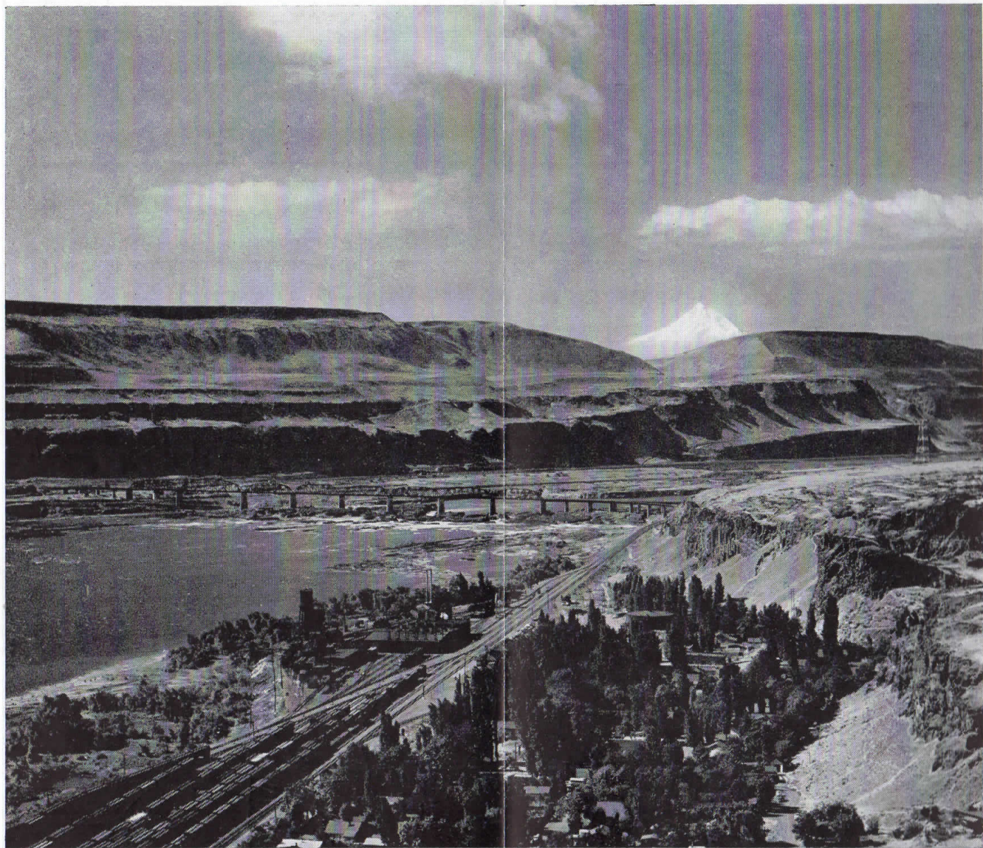
Railroad Bridge Over Columbia River at Wishram, Washington on S. P. & S. Ry. With Mt. Hood in Background