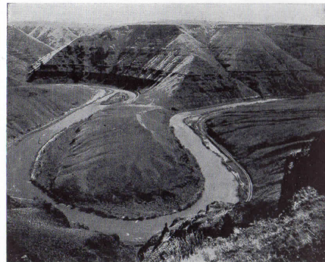
Horseshoe curve near Sinamox on the Oregon Trunk Railway

Your Choice of... Three Daily Trains Between PORTLAND and SPOKANE