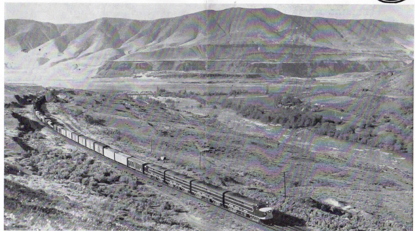
Oregon Trunk Ry. Near Moody, Oregon

S. P. & S. RY. — OREGON TRUNK RY. — OREGON ELECTRIC RY. — (Subsidiaries of Northern Pacific and Great Northern Railways)