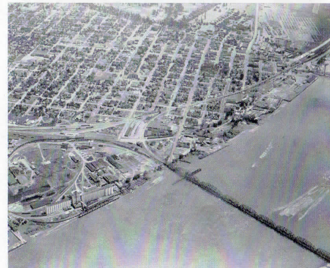
Airplane view of Vancouver, Washington and S.P. & S. bridge across Columbia River

S. P. & S. RY.—OREGON TRUNK RY.—OREGON ELECTRIC RY.—(Subsidiaries of Northern Pacific and Great Northern Railways)