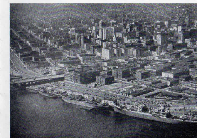
Portland — the Rose City

and Guest Stars from Stage, Screen & Radio