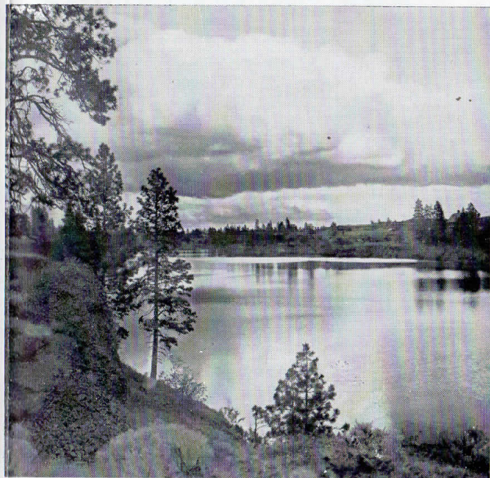
Amber Lake—thirty miles west of Spokane on S.P. & S.Ry. main line.

Your Choice of... Three Daily Trains Between PORTLAND and SPOKANE