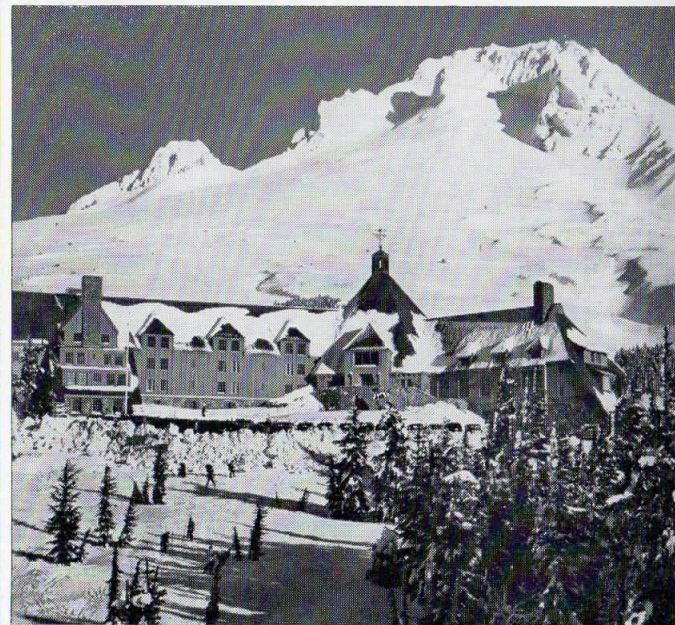
Mt. Hood (11,245 ft.) and Timberline Lodge at the 6000 foot level. Reached by short motor trip or by sight seeing buses from Portland, Oregon. Ski-lift showing above center of lodge extends one mile to 7000 foot level.

S. P. & S. RY.—OREGON TRUNK RY.—OREGON ELECTRIC RY.—(Subsidiaries of Northern Pacific and Great Northern Railways)