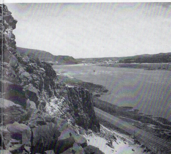
Columbia River—near Wishram, Wash. on S.P. & S.Ry. main line.