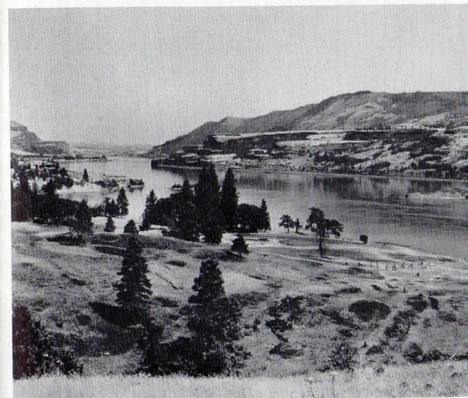
Columbia River scene west of Lyle, Washington on S. P. & S. Railway.