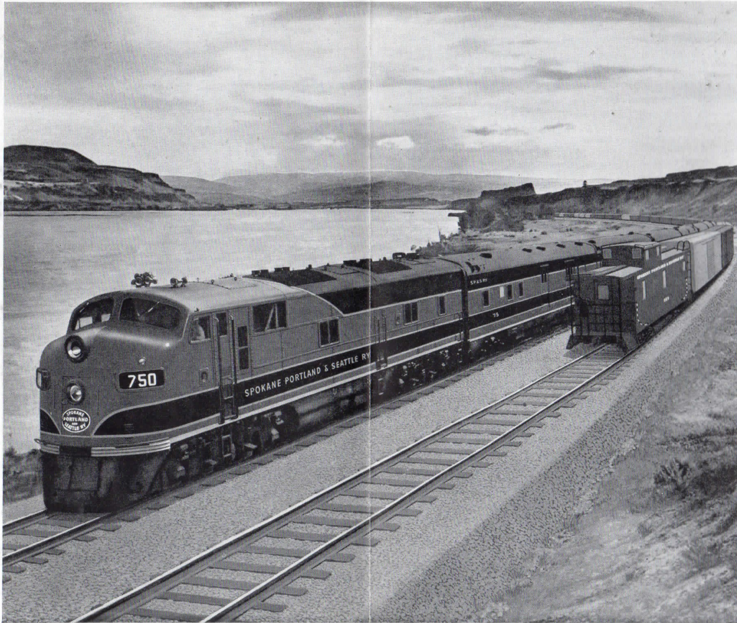
S. P. & S. Railway Company Streamliner and freight train near Avery, Washington