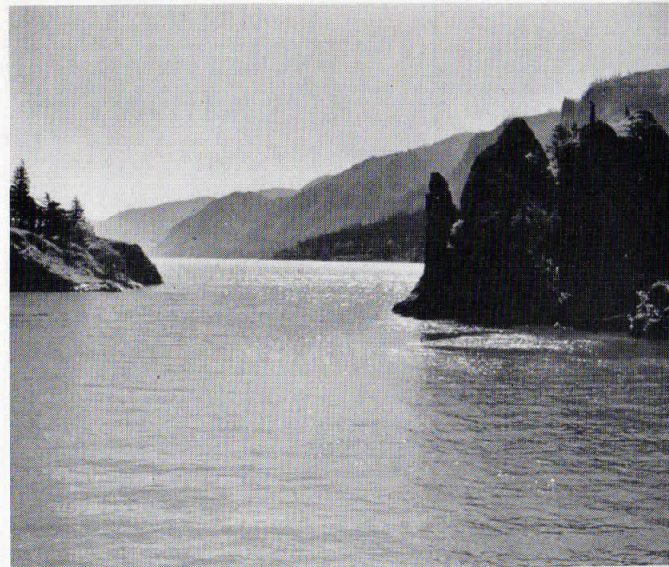
Columbia River East of Stevenson, Washington S. P. & S. Railway

S. P. & S. RY.—OREGON TRUNK RY.—OREGON ELECTRIC RY.—(Subsidiaries of Northern Pacific and Great Northern Railways)