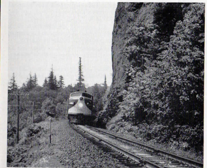
S. P. & S. Railway Train No. 6 passing Weather Bureau Rock one and one half miles east of Stevenson, Washington S. P. & S. Railway

8 to 8:30 P. M. Eastern Standard Time 7 to 7:30 P. M. Central Standard Time 9:30 to 10 P. M. Mountain Standard Time 8:30 to 9 P. M. Pacific Standard Time