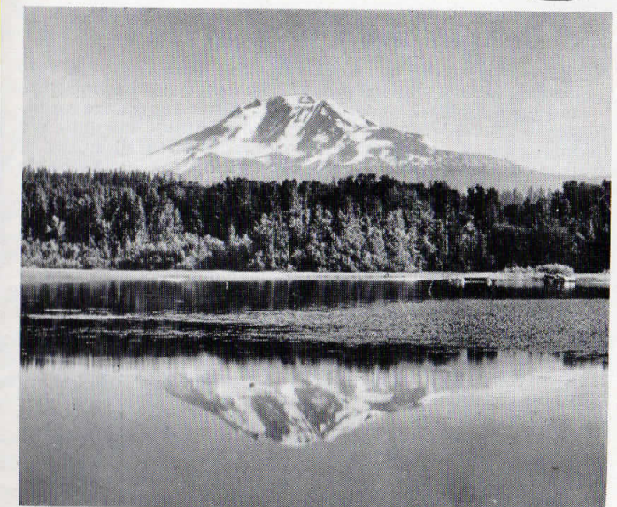
Mt. Adams and Trout Lake near Bingen-White Salmon, Washington S. P. & S. Railway