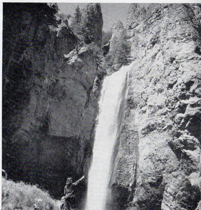
Tower Falls, near the lower end of the Grand Canyon, drop from a spectacular group of rocky needles. Yellowstone National Park.

S. P. & S. RY.—OREGON TRUNK RY.—OREGON ELECTRIC RY.—(Subsidiaries of Northern Pacific and Great Northern Railways)