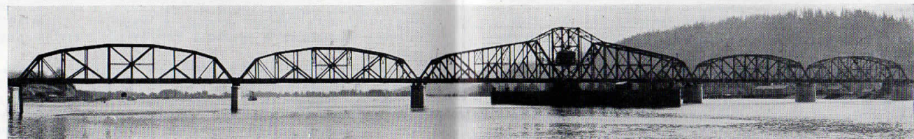
S. P. & S. RAILWAY BRIDGE ACROSS WILLAMETTE RIVER, PORTLAND, OREGON

FOR EQUIPMENT—BETWEEN PORTLAND, PASCO AND SPOKANE—SEE PRECEDING PAGES 2 and 3