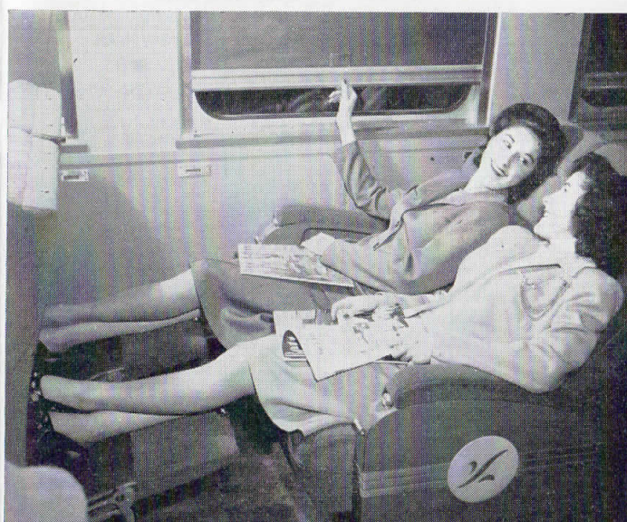
28 passengers can be accommodated in the coach section of the new buffet-lounge coach and 48 passengers in the other post-war coaches now in service on the North Coast Limited. These are the comfortable "Sleepy Hollow" seats with leg rest for reclining position.

RAILWAY EXPRESS AGENCY INC. NATION-WIDE SERVICE