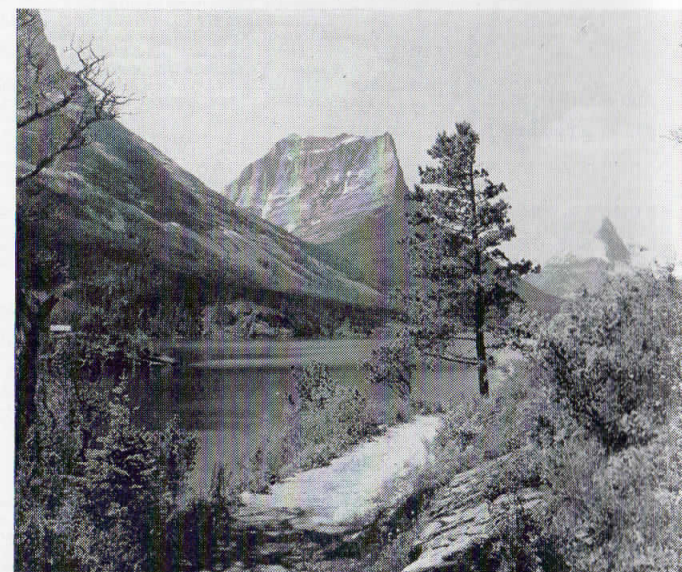
Upper end of St. Mary's Lake, Glacier National Park.—Great Northern Railway.

For the convenience of our patrons, the Spokane, Portland and Seattle Railway Company, in conjunction with other leading railroads, now offers three additional travel services as follows: