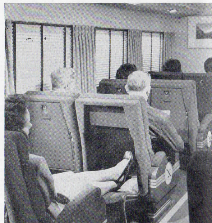
A leg rest adds to the travel ease of coach passengers on the Empire Builder, new Great Northern streamlined train.

S. P. & S. RY.—OREGON TRUNK RY.—OREGON ELECTRIC RY.—(Subsidiaries of Northern Pacific and Great Northern Railways)