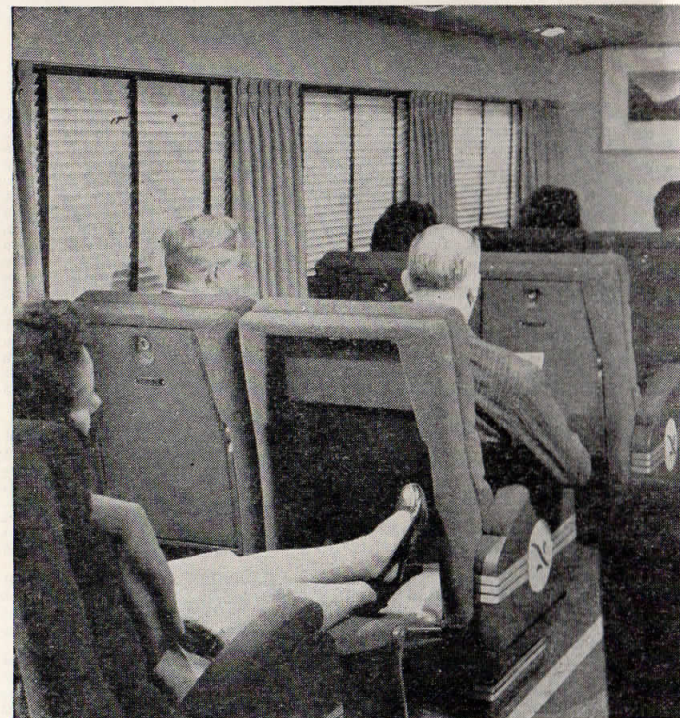
A leg rest adds to the travel ease of coach passengers on the Empire Builder, new Great Northern streamlined train.

S. P. & S. RY.—OREGON TRUNK RY.—OREGON ELECTRIC RY.—(Subsidiaries of Northern Pacific and Great Northern Railways)