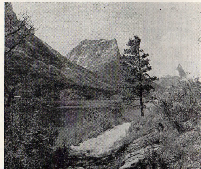
Upper end of St. Mary's Lake, Glacier National Park.—Great Northern Railway.

For the convenience of our patrons, the Spokane, Portland and Seattle Railway Company, in conjunction with other leading railroads, now offers three additional travel services as follows: