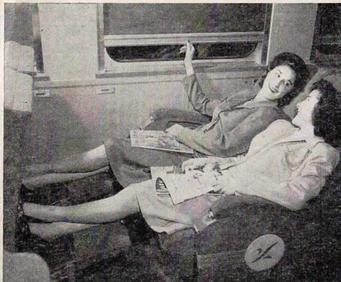
28 passengers can be accommodated in the coach section of the new buffet-lounge coach and 48 passengers in the other post-war coaches now in service on the North Coast Limited. These are the comfortable "Sleepy Hollow" seats with leg rest for reclining position.