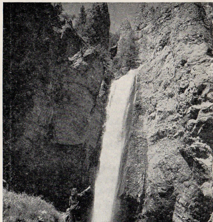
Tower Falls, near the lower end of the Grand Canyon, drop from a spectacular group of rocky needles. Yellowstone National Park.

S. P. & S. RY.—OREGON TRUNK RY.—OREGON ELECTRIC RY.—(Subsidiaries of Northern Pacific and Great Northern Railways)