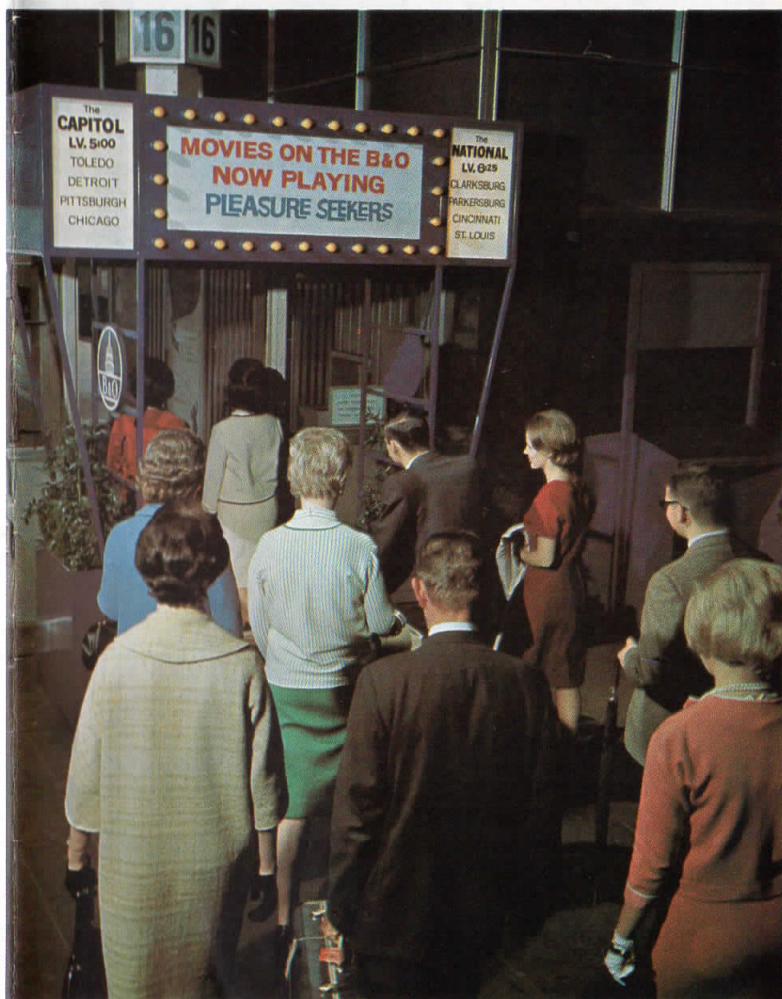
MOVIE TRAIN GATE, WASHINGTON UNION TERMINAL