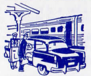
for car rental (Avis, Hertz, National)