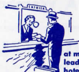
at many loading hotels