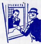
at ticket offices