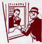
at ticket offices