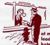
at many leading hotels