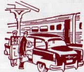
for car rental (Avis, Hertz, National)