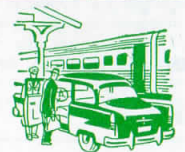
for car rental (Avis, Hertz, National)