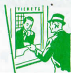
at ticket offices