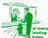
at many leading hotels