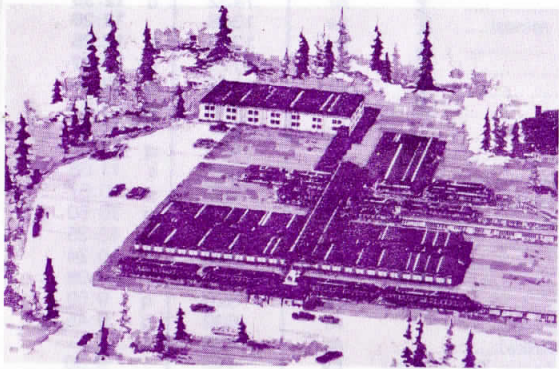
MT. MCKINLEY NATIONAL PARK STATION HOTEL