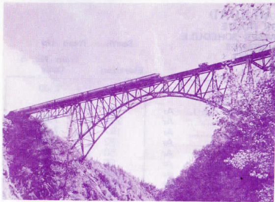
HURRICANE BRIDGE 296 Ft. Above Streambed