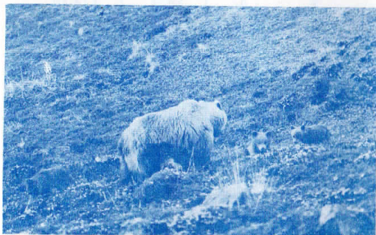
TOKLAT GRIZZLY BEARS MT. MCKINLEY NATIONAL PARK