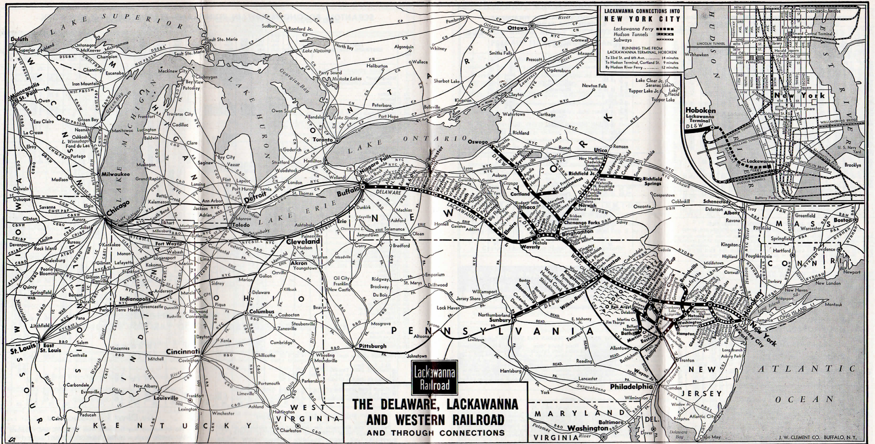
LACKAWANNA RAILROAD — The Shortest Route between New York — Scranton — Binghamton — Syracuse — Elmira — Buffalo