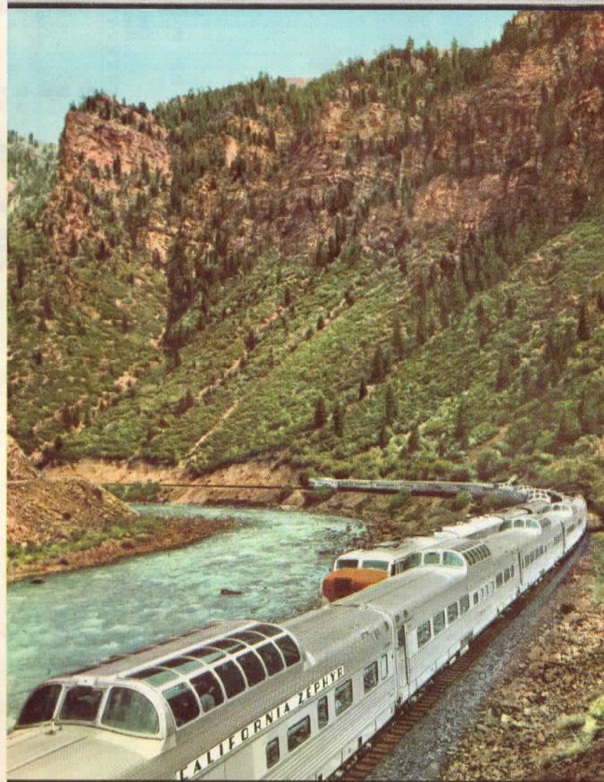
California Zephyr—Glenwood Canyon, Colorado River