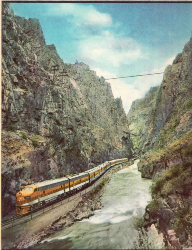
Royal Gorge of the Arkansas River