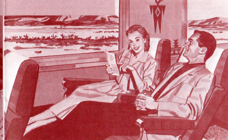
Santa Fe chair cars feature stretch-out seats and leg rests for fine riding comfort day and night. Big picture windows too.