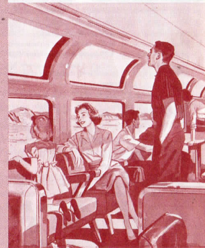
All 60 seats in El Capitan's Hi-Level Lounge offer a panoramic view of the countryside from big two-tier windows.