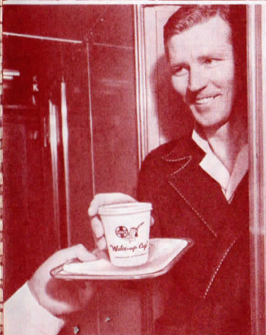
Super Chief travelers enjoy a complimentary "Wake-Up Cup" of coffee.

Pick the train that fits your travel plans best. Then let your travel agent or nearest Santa Fe ticket office give you full details on the One-Price Ticket arrangement. It saves money for individual travelers and families—covers all major travel expenses while aboard Santa Fe trains.